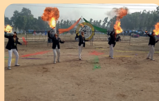
Annual Sports Day