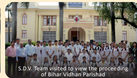
S.D.V. Team visited to view the proceeding of Bihar Vidhan Parishad