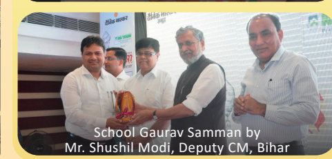
School Gaurav Samman by Mr. Shushil Modi, Deputy CM, Bihar