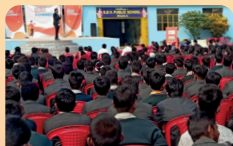
Online Learning Session