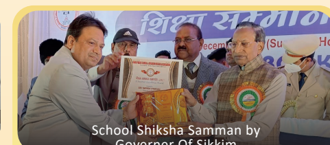
School Shiksha Samman by Governor Of Sikkim