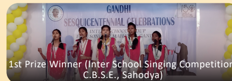
1st Prize Winner (Inter School Singing Competition, C.B.S.E., Sahodya)