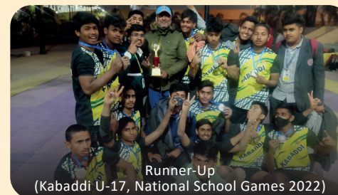
Runner-Up (Kabaddi U-17, National School Games 2022)