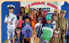
Fancy Dress Competition