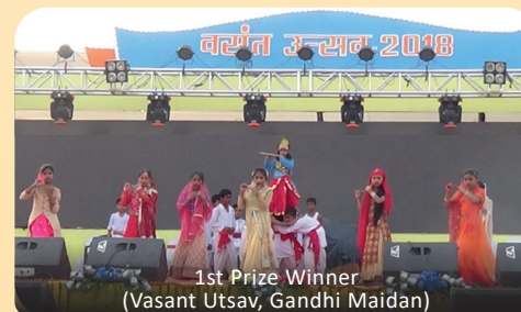
1st Prize Winner (Vasant Utsav, Gandhi Maidan)